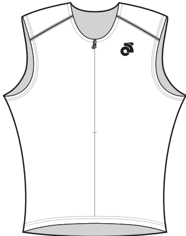
: Front View :